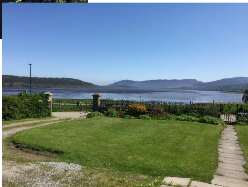
Views from the Manse